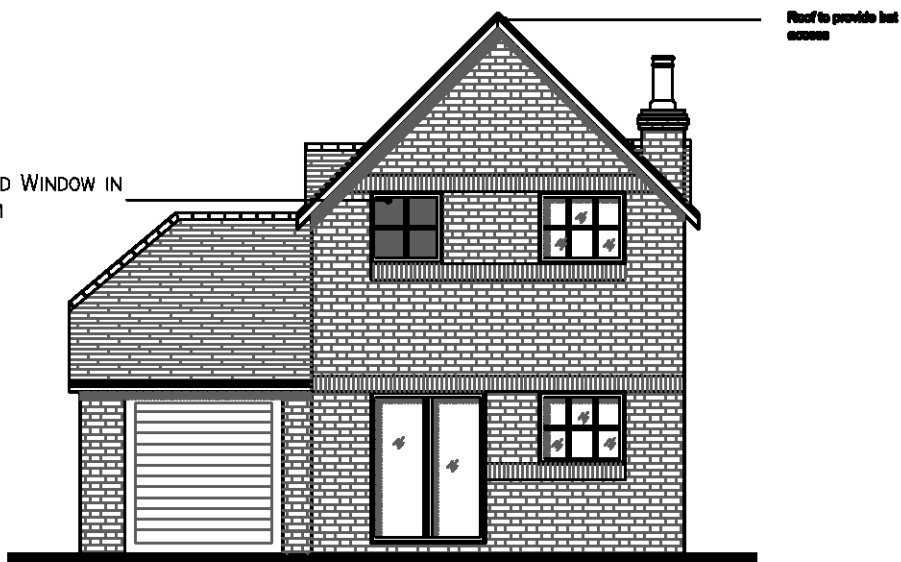
PROPOSED REAR ELEVATION @ SCALE 1:100