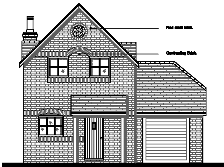
PROPOSED FRONT ELEVATION @ SCALE 1:100