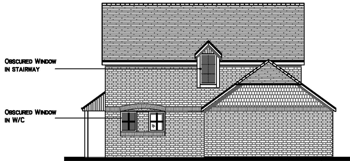
PROPOSED SIDE ELEVATION @ SCALE 1:100